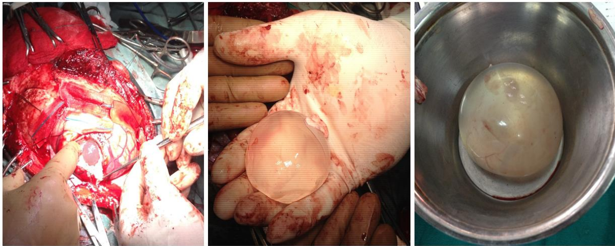
Fig. 2: Surgical excision of the brain hydatid cyst via right craniotomy through parietal bone